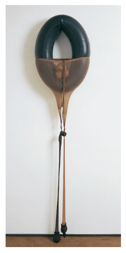
Mixed-media sculpture by Senga Nengudi, 1970s. Courtesy of Senga Nengudi and Thomas Erben Gallery, New York.