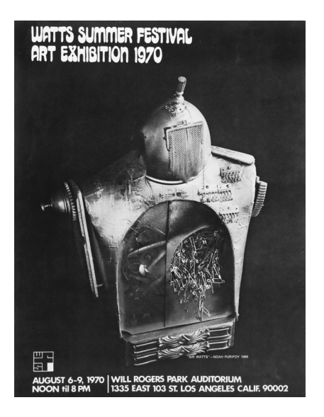
Poster for Watts Summer Festival, 1970, showing Noah Purifoy's Sir Watts, 1966.

Both Nengudi and Hassinger came to performance from the study of dance. In graduate school at UCLA in the early 1970s, Hassinger discovered what would become a pivotal medium for her: wire rope. In her hands this material came to embody the changing landscape of American sculpture from minimal to postminimal: it was a synthetic substance that, with subtle intervention, could echo organic form. These solid and industrial yet process-driven sculptures initiated activity, lending themselves to the temporality of performance. One of Hassinger's first performances, High Noon, took place within an installation of her sculpture at the ARCO Center for Visual Art in 1976. With her 1981 exhibition Dangerous Ground, Hassinger became the first African American to have a solo show at the Los Angeles County Museum of Art.