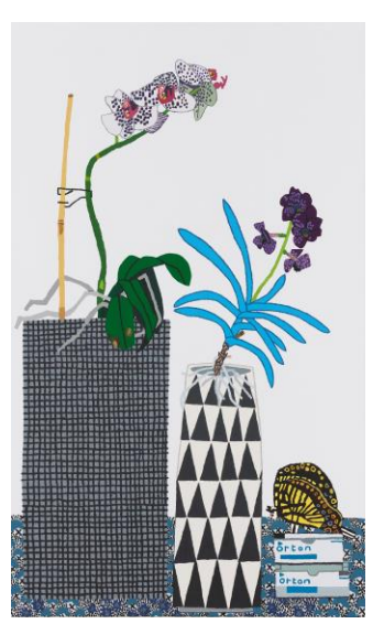
Jonas Wood Shio Butterfly Still Life Estimate $300/400,000