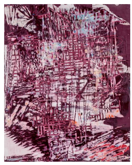
Mark Bradford Scratch Pink Estimate $2/3 million

To Be Offered across Sotheby's Marquee May Auctions of CONTEMPORARY ART In New York