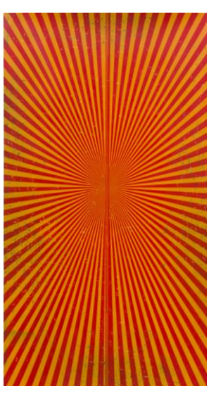
Mark Grotjahn Untitled (Poppy Red and Yellowed Orange Butterfly 50.94) Estimate $600/800,000